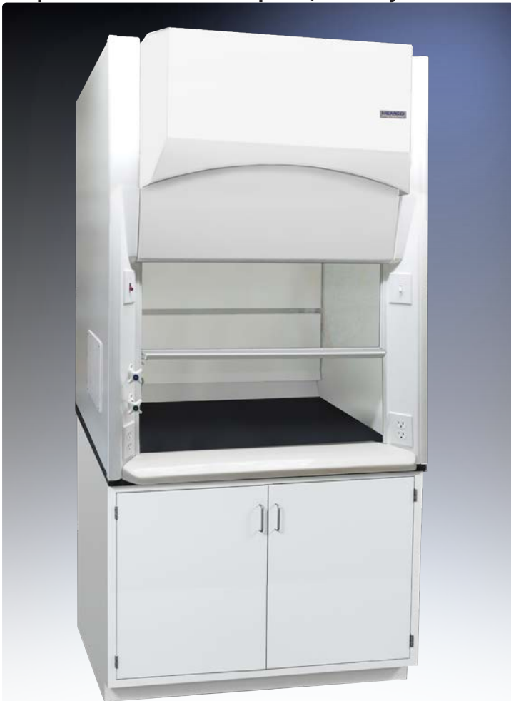
UniFlow Auxiliary Air Hood Cat. No. 21521 shown with optional epoxy resin worksurface, fixtures, and base cabinets.

Zero room air requirements. The Fume hood exhaust is equal to the auxiliary supply air, thereby zero room air is required. With the sash in the 1/2 open position and face velocity of 100 feet per minute, the CFM required equals the air supply. The hood exhaust air plus auxiliary air make up for room supply deficiencies. Since expensive tempered room air is not required, Auxiliary Air Fume Hoods provide energy savings.